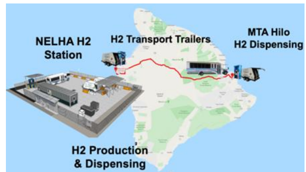
Figure 2. Concept map of hydrogen distribution.

The station includes a power monitoring system, which can monitor and control station operations by interfacing with the NELHA supervisory control and data acquisition (SCADA) system which monitors the NELHA microgrid and solar electric inputs. The total power consumption of the hydrogen system including the electrolyzer, compressor, and balance of plant is ~210 to 240 kW when operating at the maximum production rate of 65 kg/day (2.73 kg/hr). This corresponds to approximately 78-88 kwh/kg of compressed hydrogen.