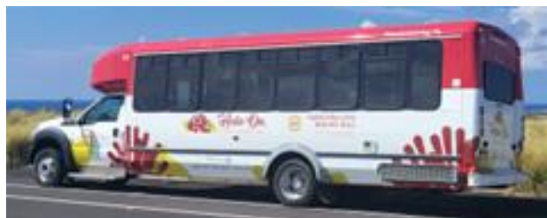
Figure 3. The Hele-On 21-passenger FCEB.

The Hele-On 21-passenger FCEB (Bus #111) (Figure 3) was previously purchased with funds from the Energy Systems Development Special Fund. This bus, manufactured by Eldorado National, and converted to a hydrogen-electric drive train by U.S. Hybrid, is ADA-compliant.