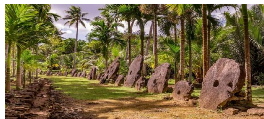
Figure 3. Rai Stone Money in Yap.

HNEI GridSTART also provided its internally developed Generation Mix Resource Modeling Tool to YSPSC personnel and trained them on its use. The team visited the island's power generation and distribution facilities and engaged in further discussion with YSPSC's management to identify potential avenues for future follow-on support, which GridSTART plans to deliver to YSPSC in 2025. HNEI GridSTART also plans to conduct additional trainings for other Pacific region utilities under its partnership with PPA.