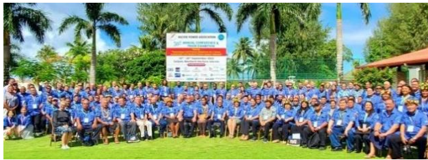
Figure 1. PPA's 30 th Annual Conference in Saipan.

BACKGROUND: PPA is an inter-governmental agency whose objective is to improve the quality of power in the Pacific region through a cooperative effort among the utilities, private sector and regional aid donors. HNEI has been working with PPA since 2023, when HNEI GridSTART participated as an invited presenter at PPA's 30 th annual conference in Saipan. Over the past year, GridSTART has worked with PPA to shape a partnership to deliver much needed capacity building to PPA's member utilities.